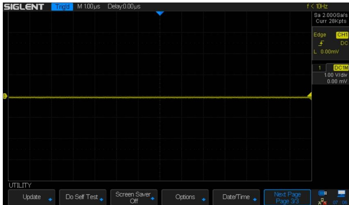
Figure 1 UTILITY function menu