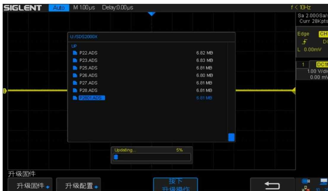
Figure 4 There will be a progress bar prompt during the upgrade process.