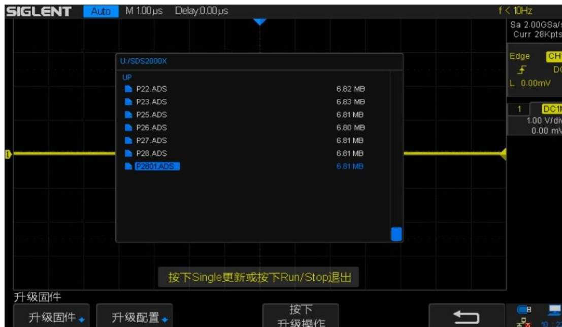
Figure 3 Press the Single button to start the upgrade according to the prompt